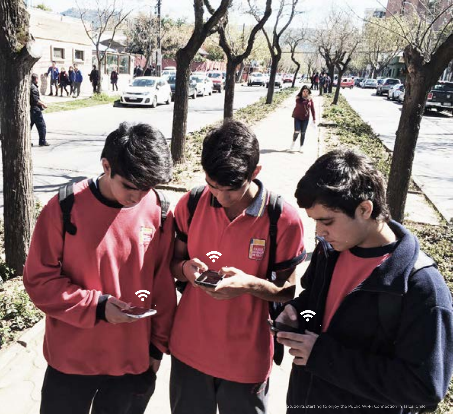
Students starting to enjoy the Public Wi-Fi Connection in Talca, Chile